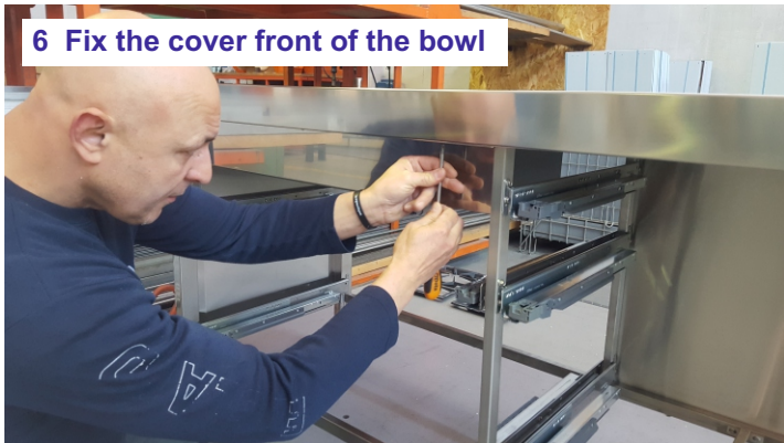
6 Fix the cover front of the bowl