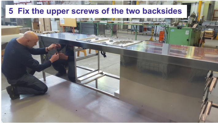
5 Fix the upper screws of the two backsides