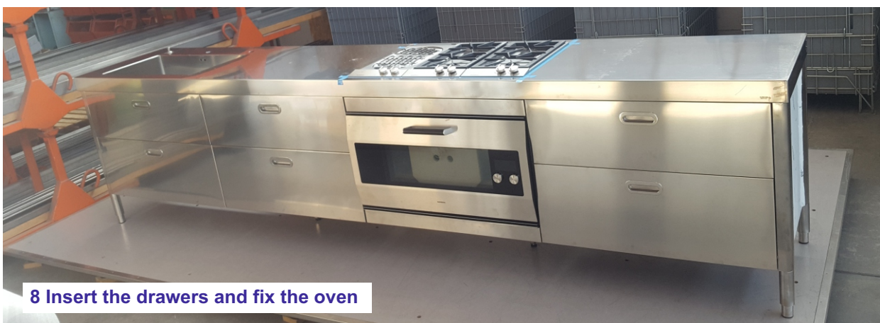
8 Insert the drawers and fix the oven