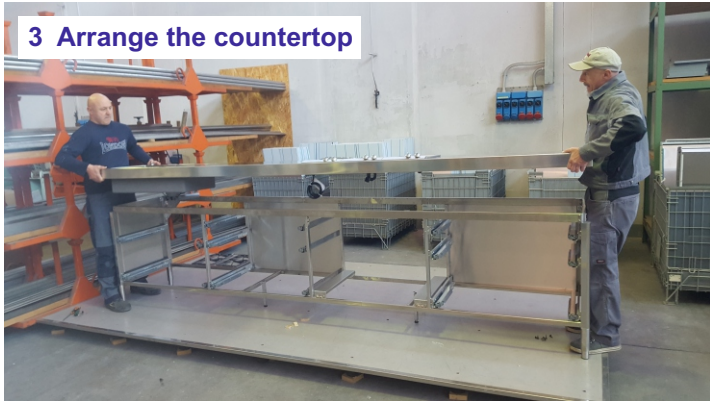
3 Arrange the countertop