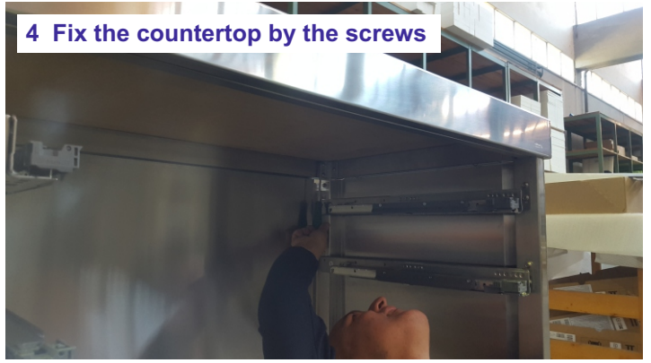
4 Fix the countertop by the screws